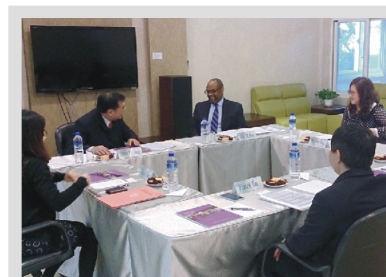
Delegation from Texas A&M University