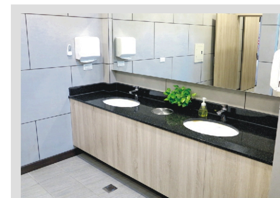
Lady's Room after remodeling