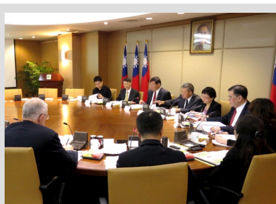
Board of Directors and Executive Committee meeting