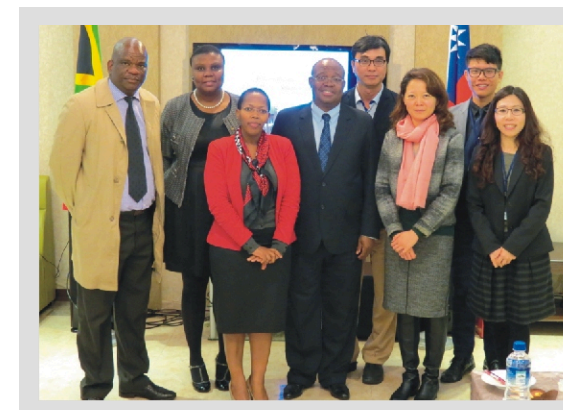
Delegation from South Africa