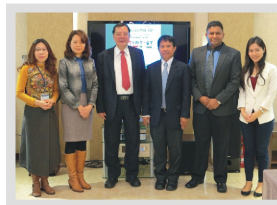
Delegation from Growth Triangle