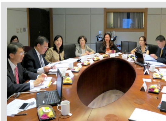
Executive Committee meeting