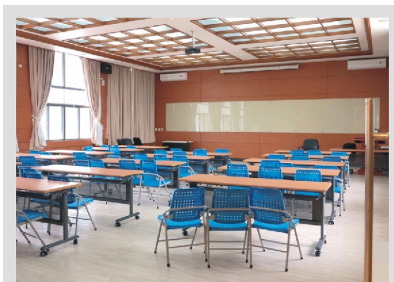
Room 201 (Floor remodeling)