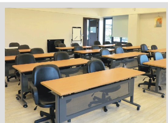
New classroom after remodeling (Room 207)

In order to provide a safer, more comfortable and modernized learning and living environment, the Center continued working on improvement of the software and hardware equipment including information and internet facilities.