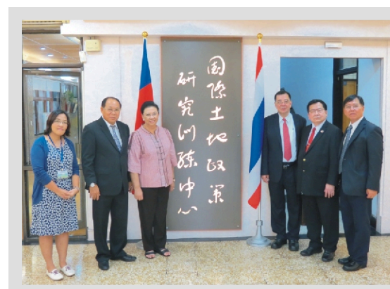
Delegation from Thailand