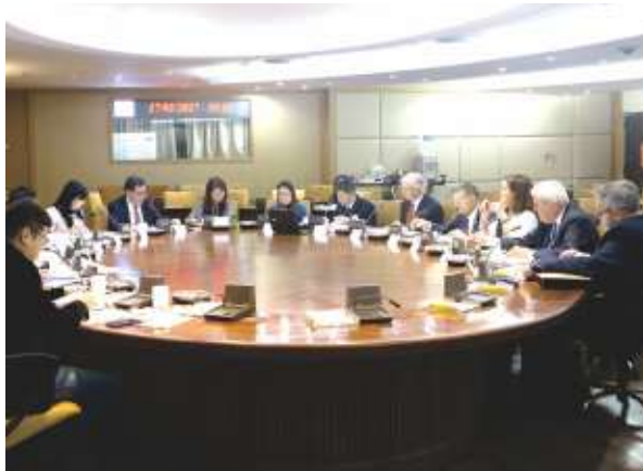
Joint Meeting of Board of Directors and Executive Committee