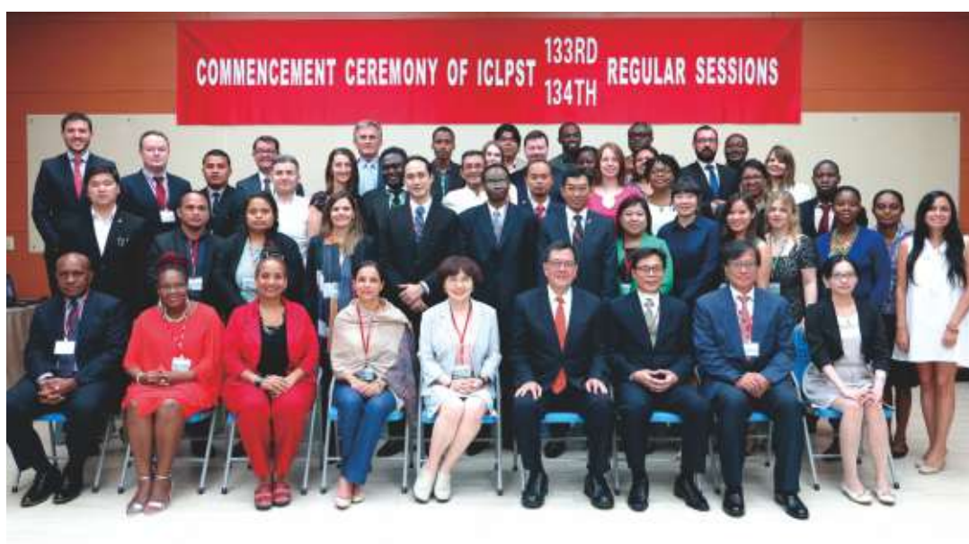
Commencement for the 133 rd and 134 th Regular Sessions